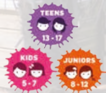
Kids and teens clubs